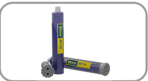
HAMMERS & BITS