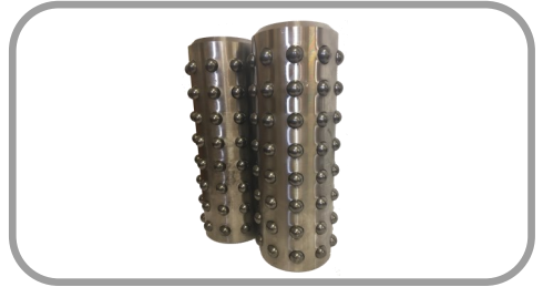
PINS / BUSHINGS / Roller Reamers